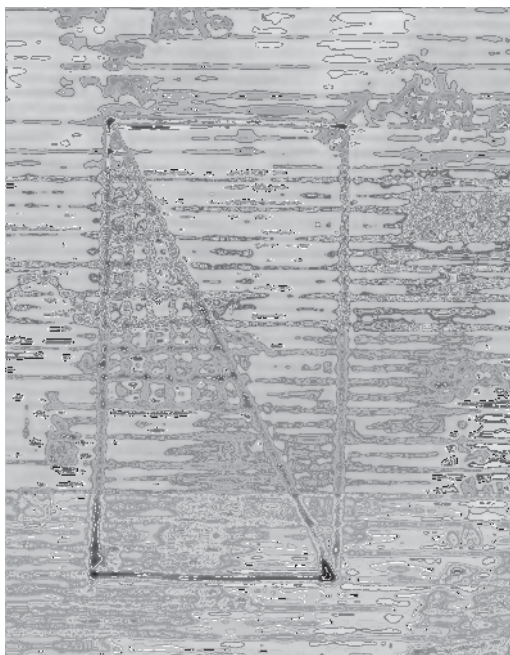
Figure 2a. Diagram used in Aisha's group report.