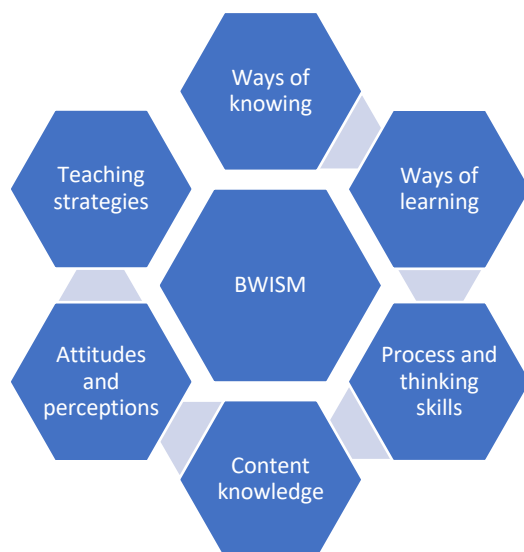
Figure 1. Summary of the Berlin-White Integrated Science and Mathematics Model (BWISM). (Berlin & White, 1994).

In 1994, Berlin and White developed one of the first models to demonstrate the diversity in opinion of what it meant to connect mathematics with science. It included six aspects (Figure 1) to help teachers develop connected learning tasks. They emphasised the importance of students recognising content overlap; the impact of the teachers’ level of content expertise; the use of real-life projects and problems for authenticity; the need for cross-curricula assessments and the importance of a common language between the two subjects. The strengths of this model include the attention to detail of the teaching methods and the assistance it provides in enabling teachers to identify connections. Whilst the model identifies commonalities between the six aspects for both mathematics and science, there are different epistemic practices between mathematics and science, different ways of reasoning and different types of knowledge used and produced (Clarke, 2014). These key differences provide insight into the difficulty teachers have experienced in using this model to develop totally integrated curriculum experiences (Kiray, 2012).