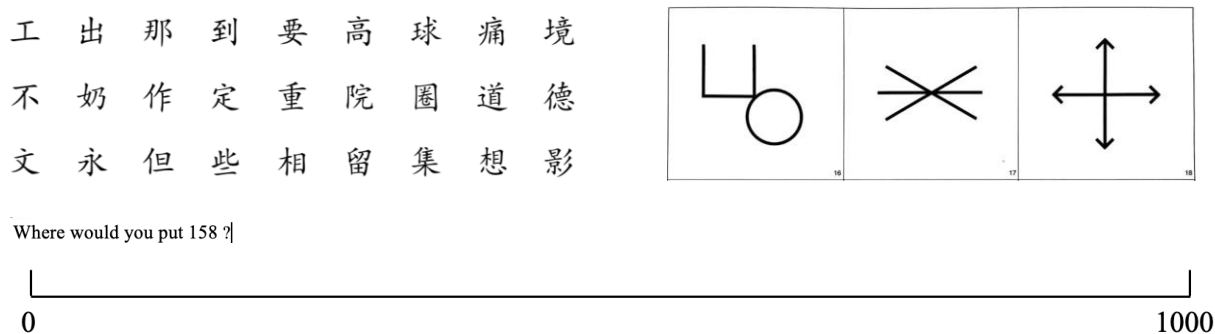
Figure 2. Sample characters/forms/items in the Chinese handwriting, VMI, and number line estimation tasks.

Students were asked to complete a variety of paper-pencil tasks, including handwriting, VMI, and number-line estimation (See some sample tasks in Figure 2). Students were assigned tasks in their classrooms (one class at a time). The handwriting task required students to copy a 9*10-Chinese character template (All of the characters were chosen based on the Chinese characters' six main basic structural forms, and 25 out of the 30 basic stroke units, ensuring their representativeness; Li-Tsang et al., 2011) as accurately as possible in 4 minutes. The VMI required students to duplicate 24 line drawings of specified geometric designs (Beery & Beery, 2010). The number line estimation comprised 22 problems involving the numbers 0-1000, in which participants needed to determine the location of a target number on a blank number line, and the error between the target number's actual position and the participant's estimate reflected the participants' internal mental number line representation. The VMI and number line estimation tasks consisted of two phases, i.e., the practice and the experimental phases. In both phases, the invigilator (the first author) supplied detailed response instructions (see Booth & Siegler, 2006 for details). Two more teachers were assigned to manage class discipline and ensure that participants provided careful responses.